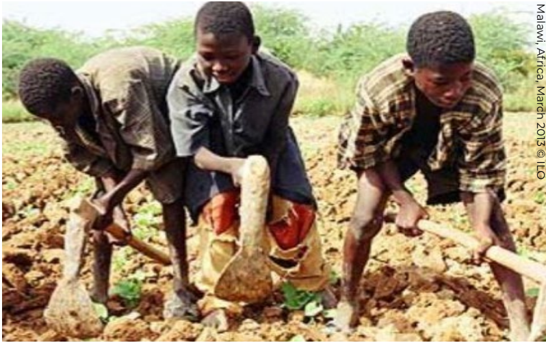
Malawi, Africa, March 2013

These boys live in Malawi. They work all day in the fields and cannot go to school. They're using tools called hoes to break up the dry soil and dig up any weeds they may find. Their backs get very tired from bending over for many hours as they dig. The boys aren't wearing any shoes to protect their feet. The hoes are heavy and can sometimes slip and cut them.