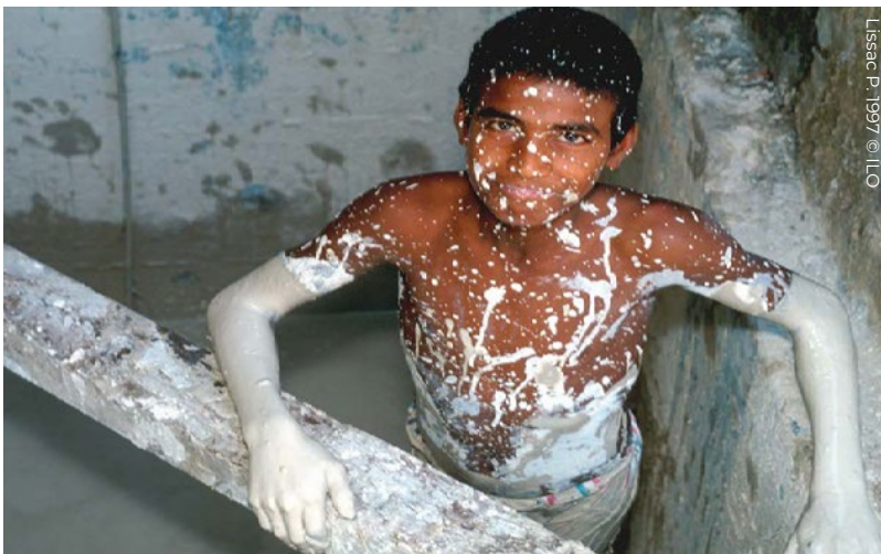
Lissac P. 1997 © ILO

This picture was taken during the daytime. Do you think they have time to work and also go to school?