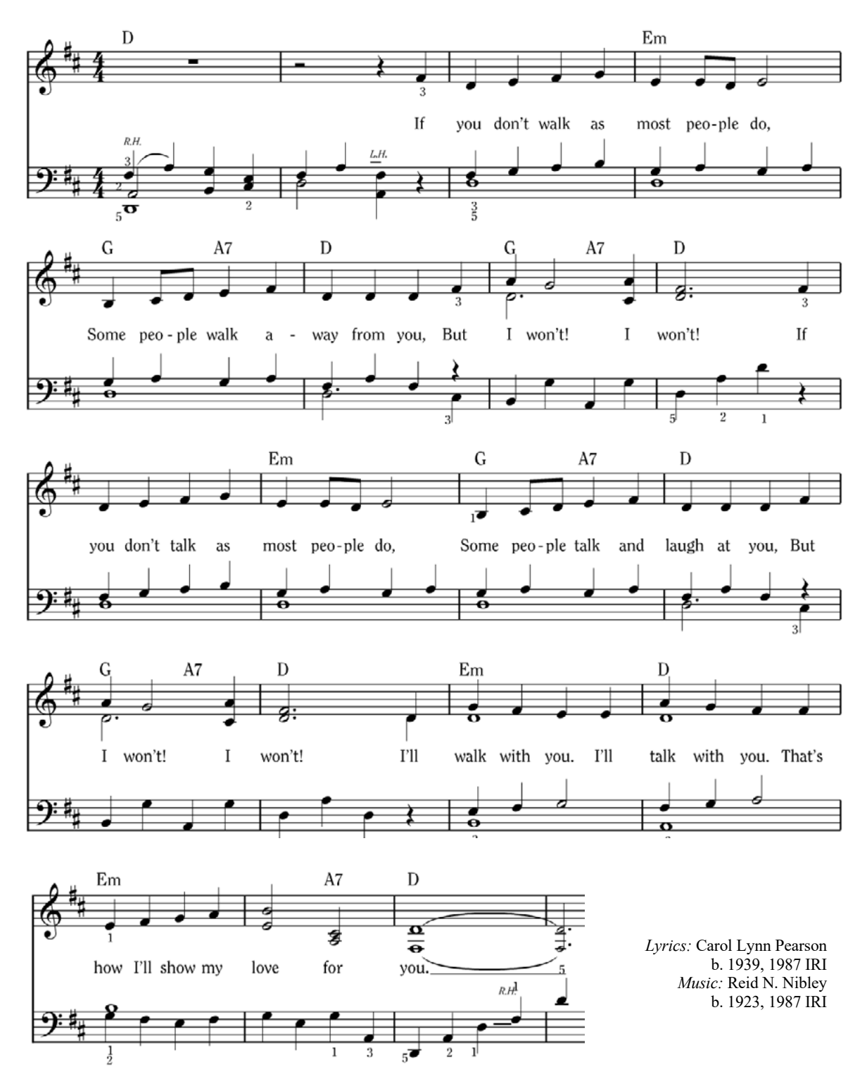
To hear the music go to the RESOURCES tab on the website: www.go-hre.org/music