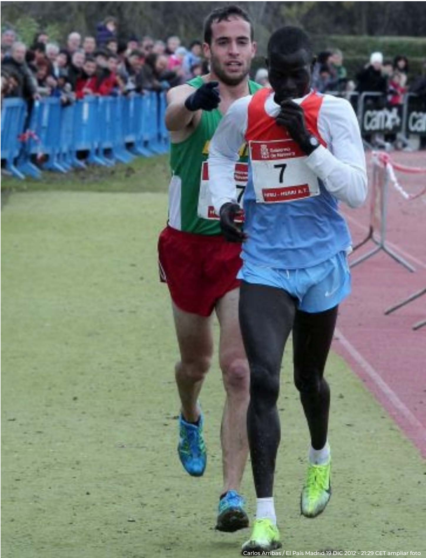
Madrid 19 DIC 2012 - 21:29 CET ampliar foto